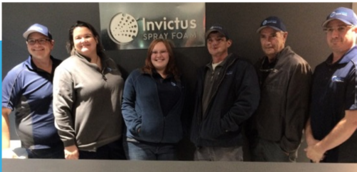
Invictus Staff - thank you!

Thanks so much to our wonderful hosts Invictus Spray Foam in Newton, NH. Our members and friends were treated to walk up food service at the Fat Belly food truck parked just outside. Door prizes included tickets to Spooky World donated by iHeartMedia and a custom made corn hole game made by Invictus.