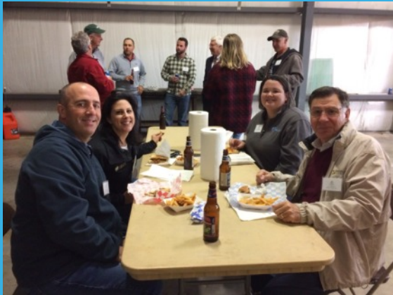
Our good friends from American Cabinet Corp enjoying a delicious dinner