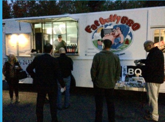
Food Truck fun!