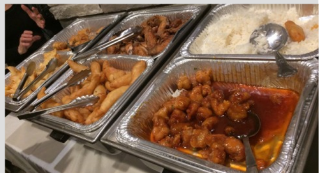
Our delicious Chinese buffet!