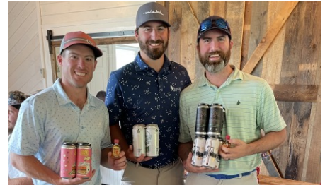
Third Place - Cross Insurance