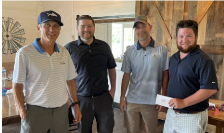
First Place - Baron's Major Brands