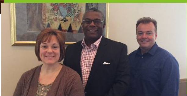
Sprout for Business