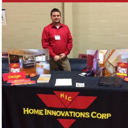
Program Sponsor-Home Innovations Corp.