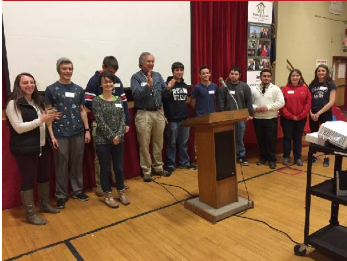
Architecture and Design students