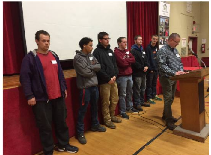
Welding Technology Students