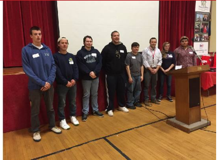
Building Construction Technology students