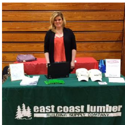
Program Sponsor-East Coast Lumber