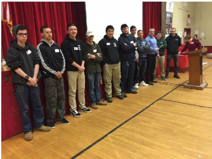
Electrical Technology students