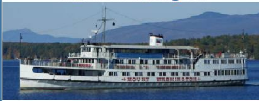
M/S Mt Washington

COME ABOARD! HORS D'OEUVRES & DINNER! CASH BAR! GREAT MUSIC! GIVE AWAYS! GET ON DRONE CAM!