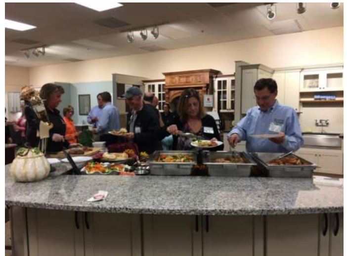
SNHHBRA members enjoying a delicious dinner buffet!