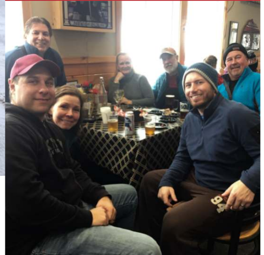
Enjoying ski stories of the day at Apres at the Cannonball Pub