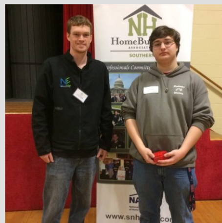
Pinkerton Day award-inning students