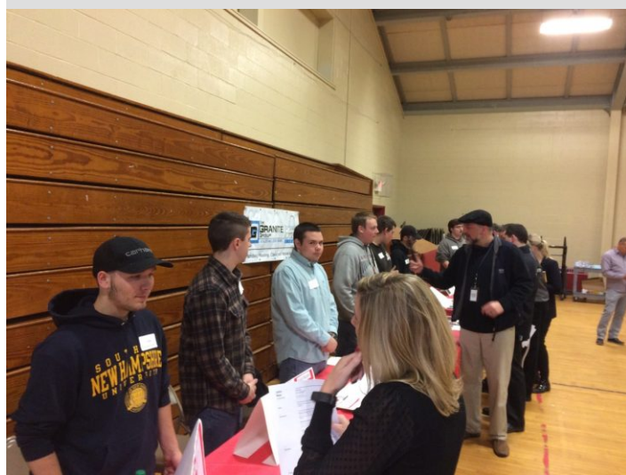
Pinkerton's Trades students “ Reverse Job Fair”