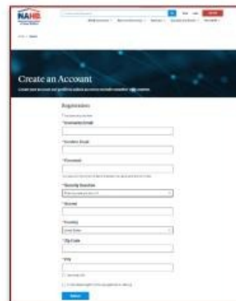
Create an Account Page